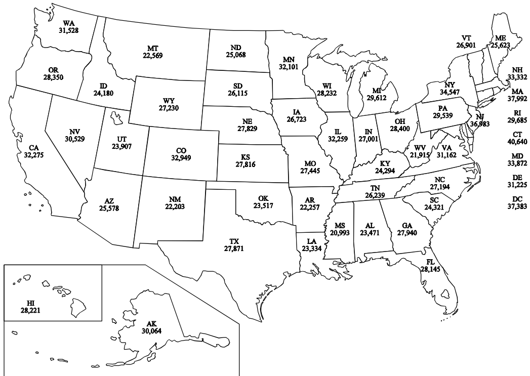
Figure 1 Per Capita Personal Income in the United States 2000 (Preliminary) U.S. Average $29,676